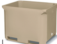
TYPE 310 PUR 915x715x710 mm