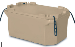
TYPE 70 PUR 750x485x390 mm

Used when thermal insulation is necessary, e.g. in places with limited access to refrigeration equipment or when there are extremely high or very low temperatures.