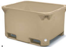
TYPE 620 PUR 1220x1010x750 mm