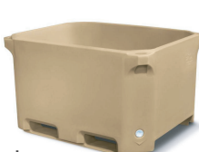
TYPE 600 PUR 1200x1000x750 mm