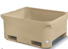
TYPE 460 PUR 1230x1030x580 mm