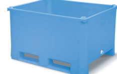
TYPE 605 PE 1200x1000x760 mm