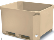
TYPE 650 PUR 1230x1030x750 mm