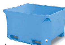
TYPE 660-3 PE 1230x1030x750 mm