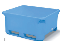
TYPE 400 PE 1200x1000x570 mm