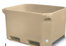
TYPE 1000 PUR 1470x1180x890 mm