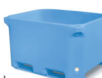
TYPE 1000 PE 1470x1180x890 mm