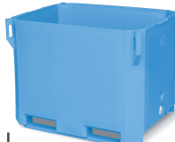
TYPE 380 PE 950x750x750 mm