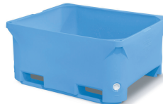
TYPE 460 PE 1230x1030x580 mm