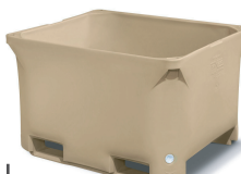
TYPE 660-3 PUR 1230x1030x750 mm