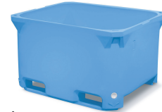
TYPE 620 PE 1220x1010x750 mm