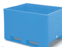
TYPE 630 PE 1200x1000x785 mm