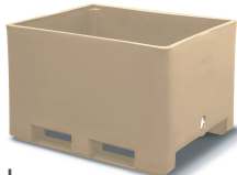
TYPE 630 PUR 1200x1000x785 mm