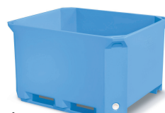
TYPE 650 PE 1230x1030x750 mm