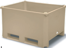
TYPE 605 PUR 1200x1000x760 mm