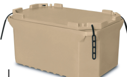
TYPE 100 PUR 805x530x425 mm