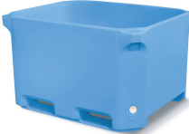
TYPE 600 PE 1200x1000x750 mm