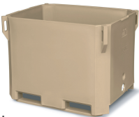
TYPE 380 PUR 950x750x750 mm